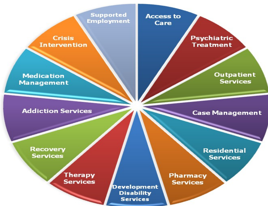
Figure 8-1: Types of Services Provided by Douglas Community Services Board